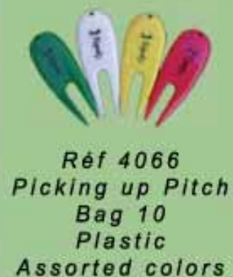
Réf 4066 Picking up Pitch Bag 10 Plastic Assorted colors