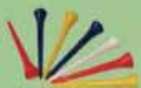
Réf 4059 / 4060 Plastic Tees Bag 25 54 or 70 mm Assorted colors