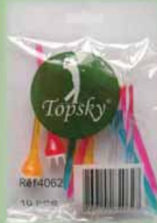
Réf 4062 CROWN Tees Bag 10 70 mm Assorted colors