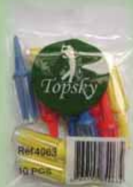
Réf 4063 BRUSH Tees Bag 10 64 mm Assorted colors