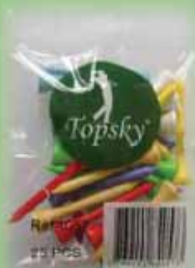
Réf 4057 / 4058 Tees bois Bag 25 54 or 70 mm Assorted colors