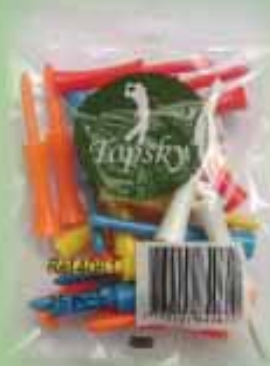
Réf 4061 STEP Tees Bag 25 tees 67 mm Assorted colors